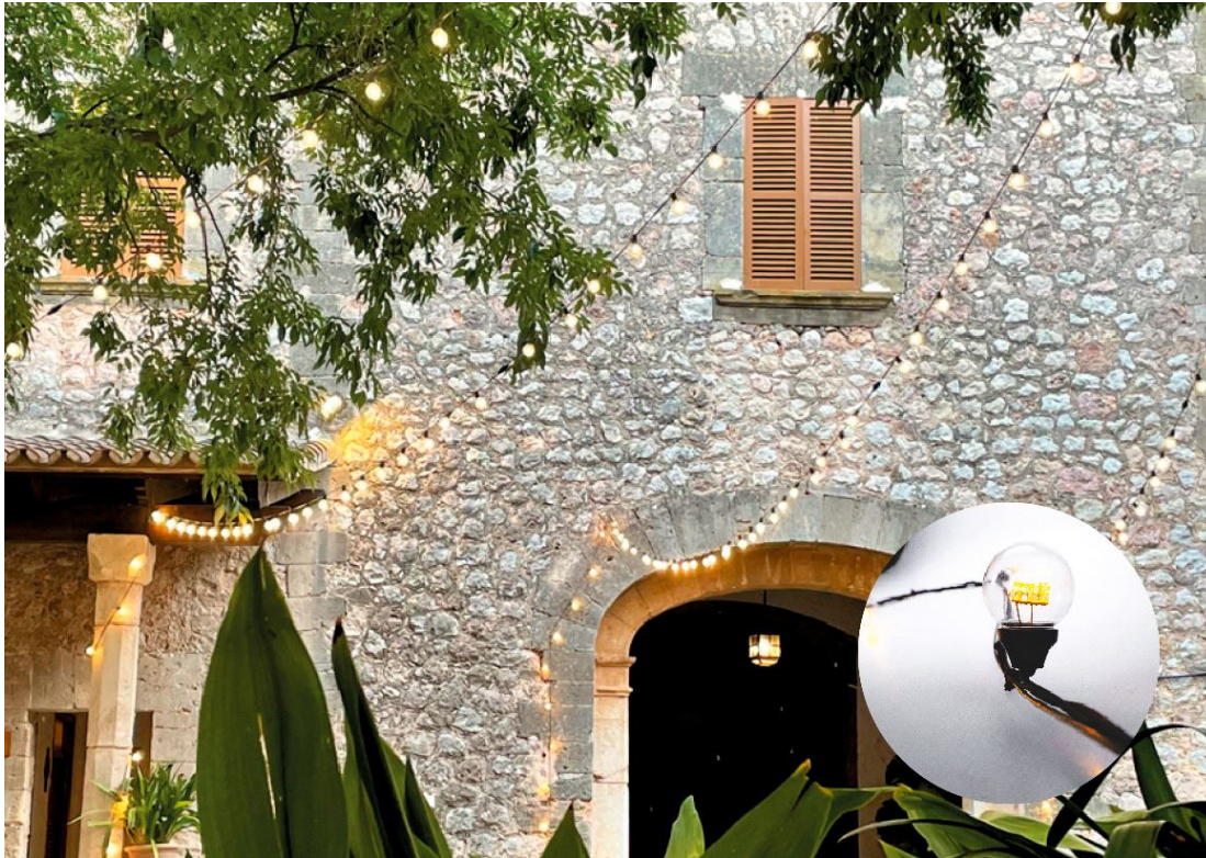
650W - L : 51,25m ( 5 x 10,25 m )